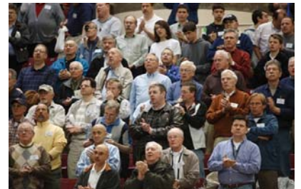
More than 2,200 men attended.