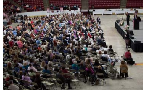
More than 2,350 women attended.

The theme for this Divine Mercy Sunday gathering was "Trust in the Lord with All Your Heart," a sentiment endorsed by many of the speakers as the proper response to life's trials and disappointments.