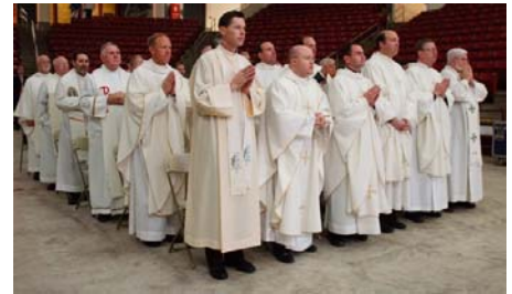
More than 125 priests attended the Conference.

Cardinal Sean O'Malley celebrated the culminating Mass, in his homily tying together themes of the day with the Divine Mercy Sunday reading about "doubting Thomas." Slideshows and videotapes of many of the keynote addresses are available at www.CatholicBoston.com .