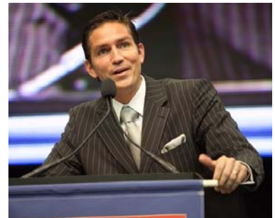
Jim Caviezel shares a light moment.