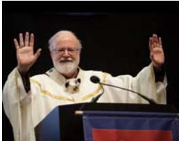
Cardinal Seán O'Malley is welcomed by the women assembled.